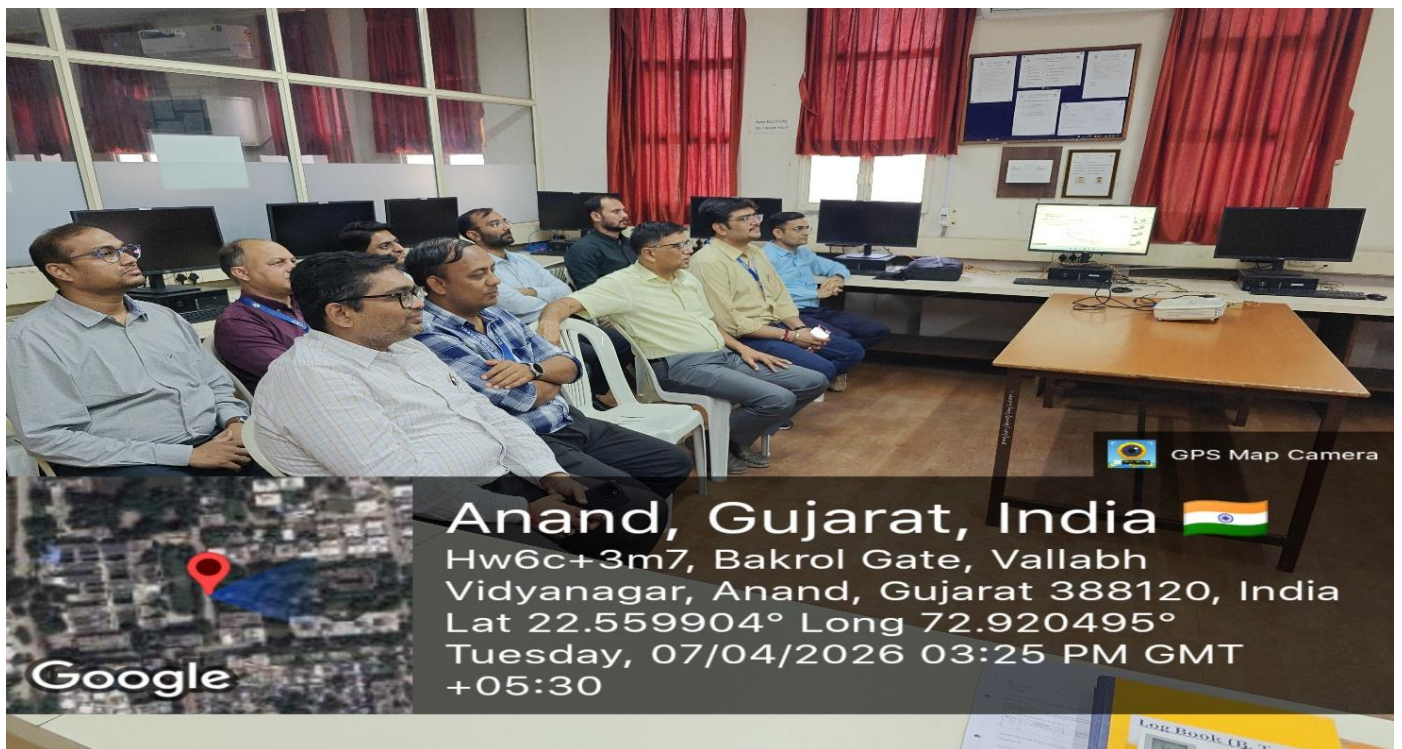
Fig.2 FDP attended by the faculty members of Mechatronics Department