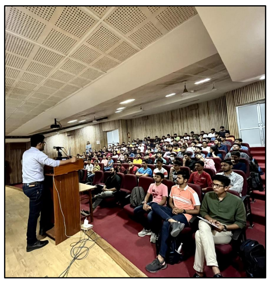
Computer Society of India, Student Branch, GCET, Vallabh Vidyanagar