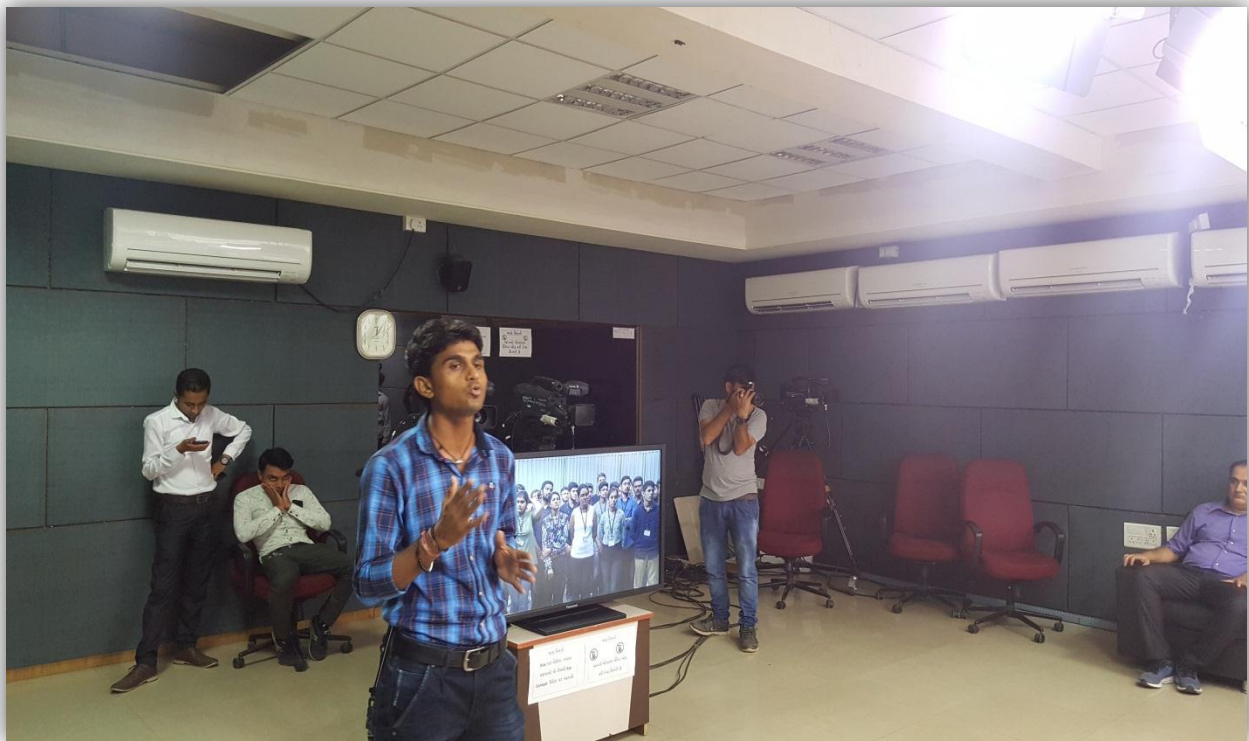
Department of Electronics & Communication Engineering G. H. PATEL COLLEGE OF ENGINEERING & TECHNOLOGY, VALLABH VIDYANAGAR (A Charutar Vidya Mandal Institution)