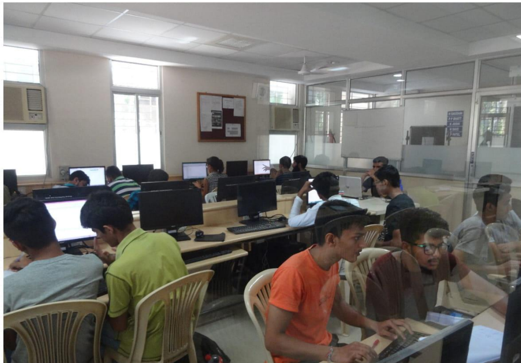
Round 2- Lab 2