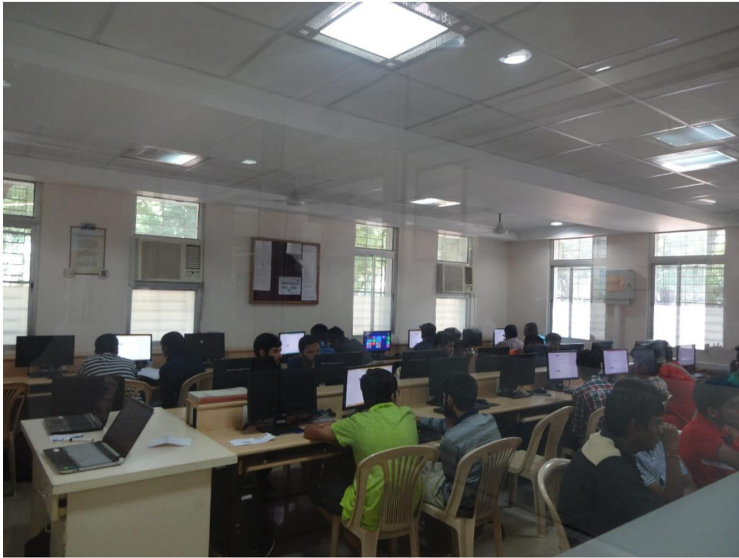
Round 2- Lab 1