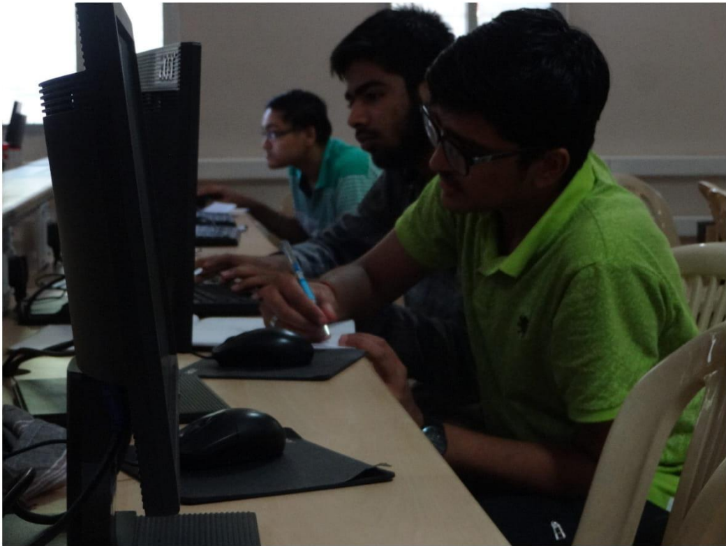
Team solving problem in round-2