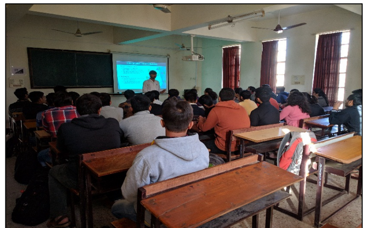
Explaining about Block Chain