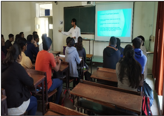
Discussion about Crypto currencies