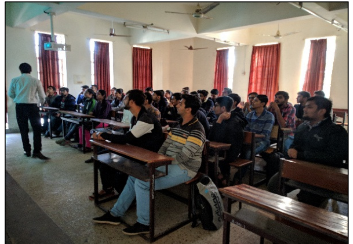
Students of IT & CP