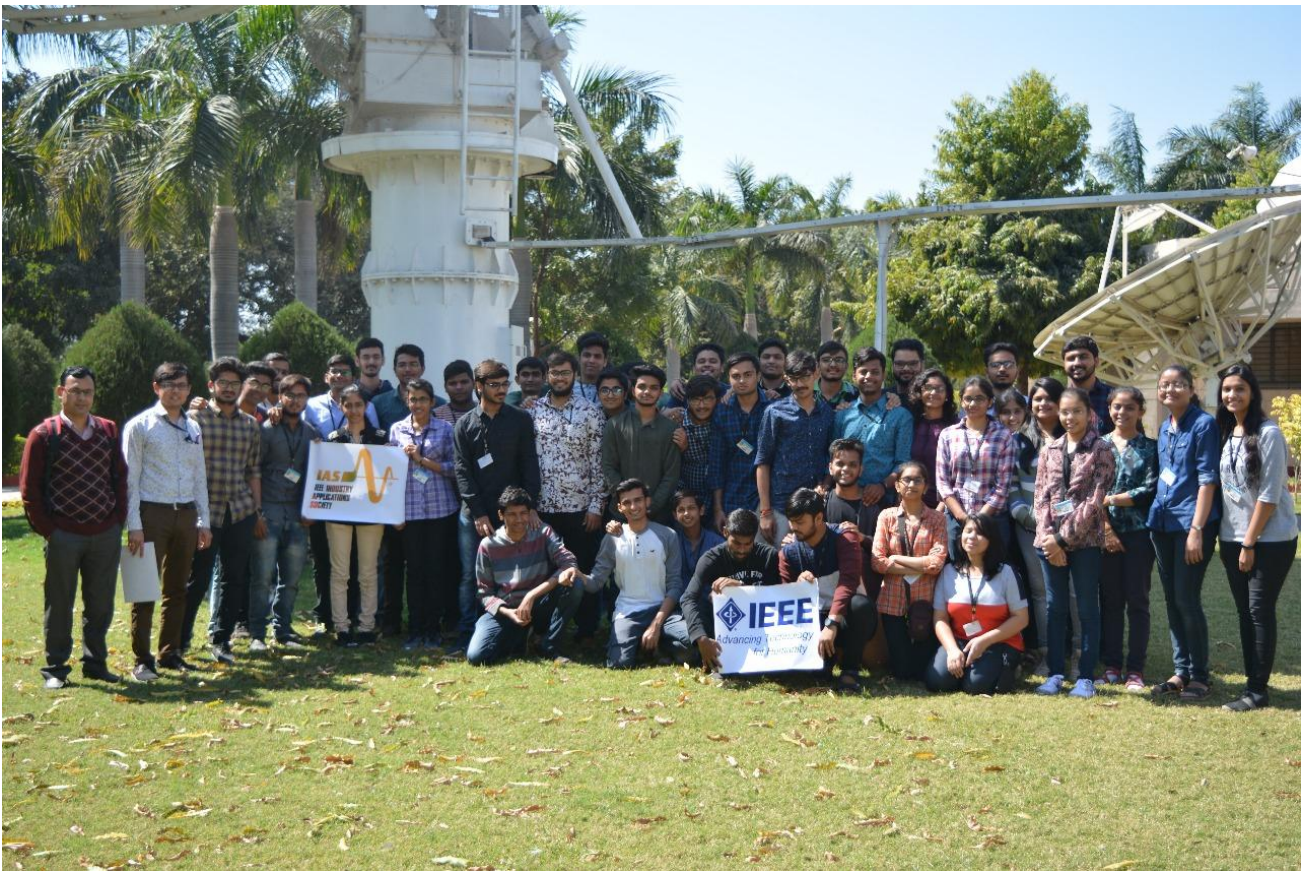
Department of Electronics & Communication Engineering G. H. PATEL COLLEGE OF ENGINEERING & TECHNOLOGY, VALLABH VIDYANAGAR (A Charutar Vidya Mandal Institution)