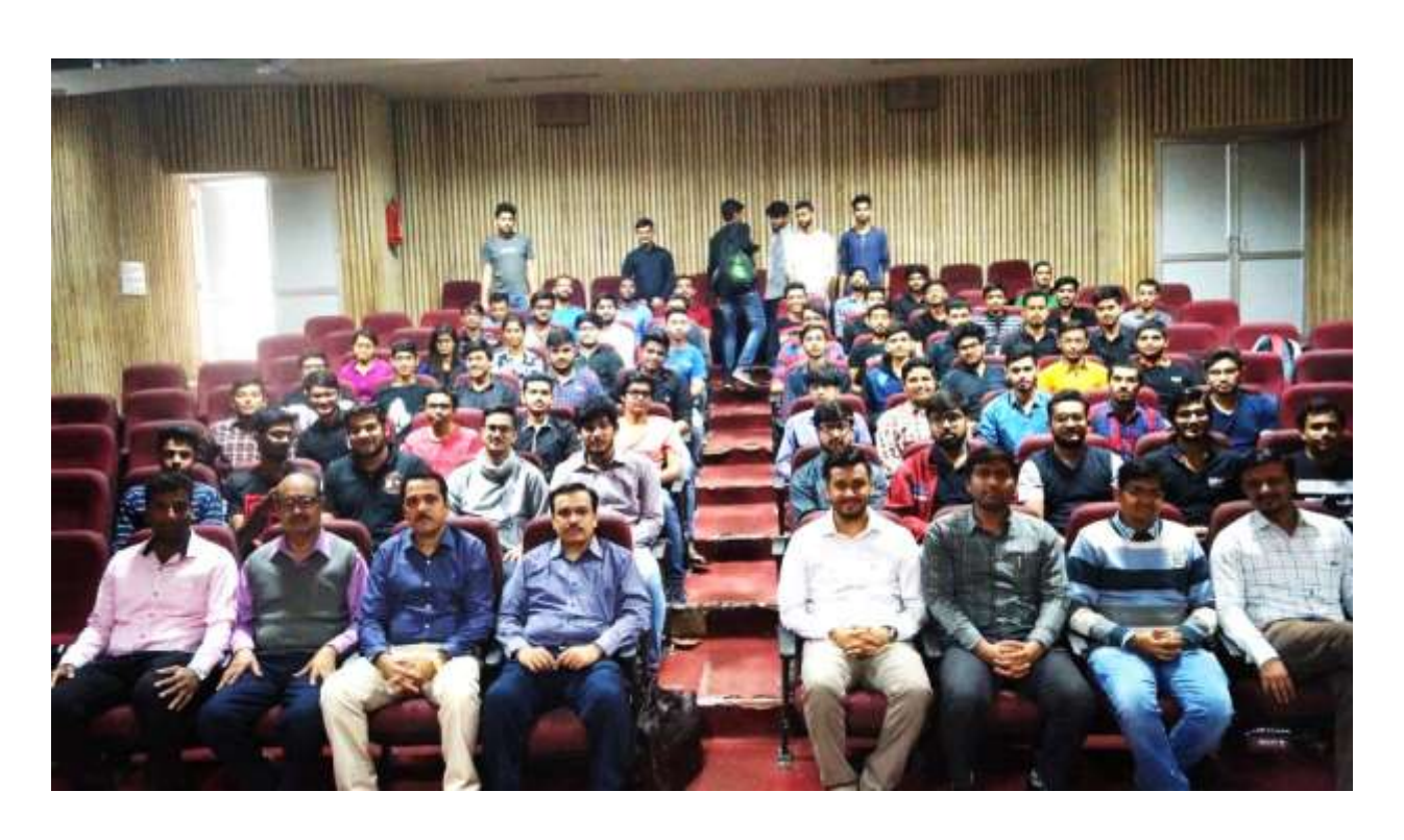
Organizing Team with participants