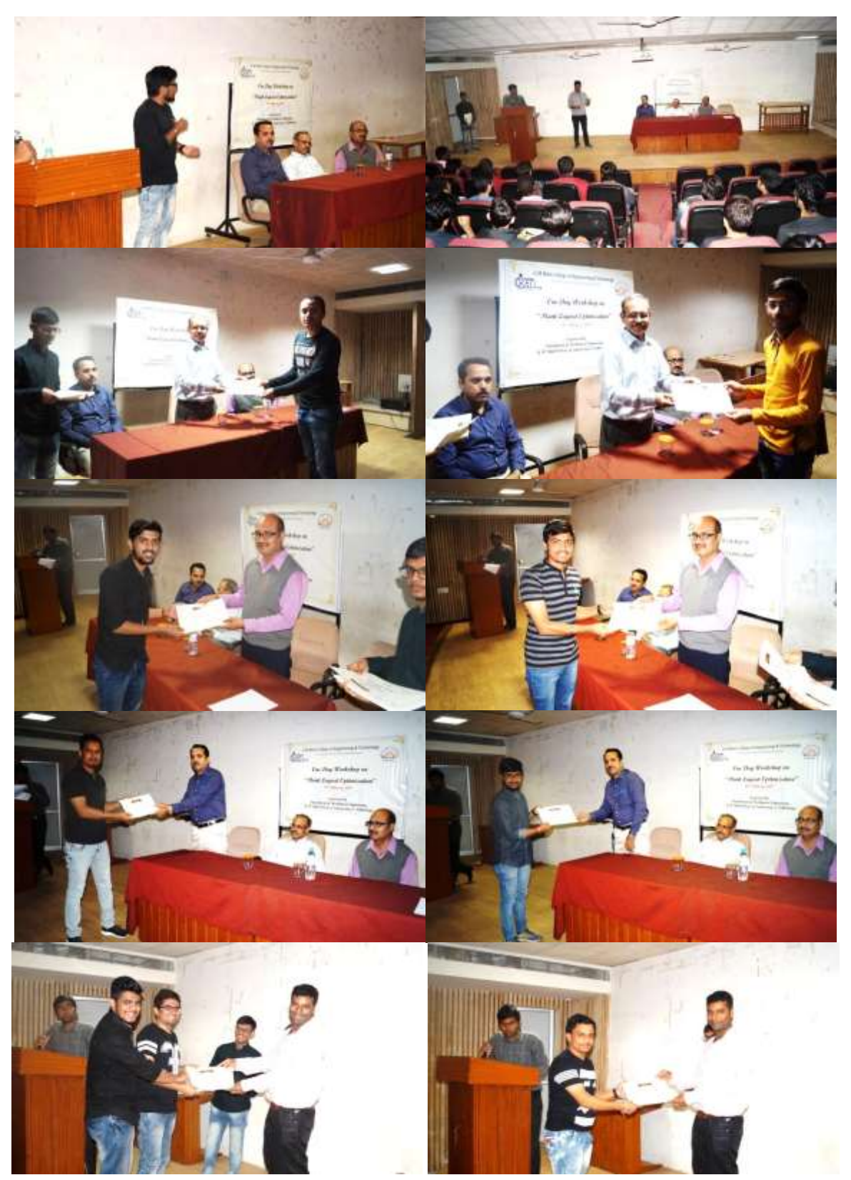
Feedback & Cerfificate Distribution