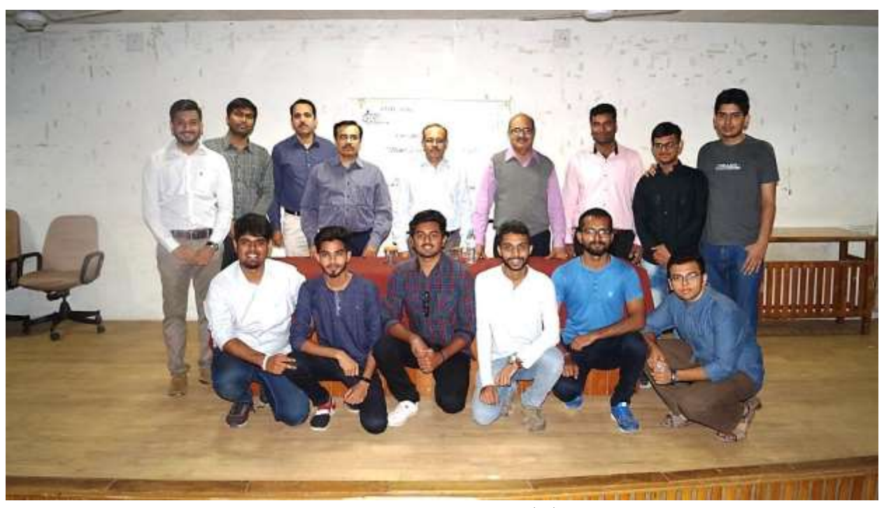
Organizing Team of Workshop